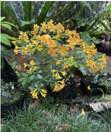
R. acrophilum