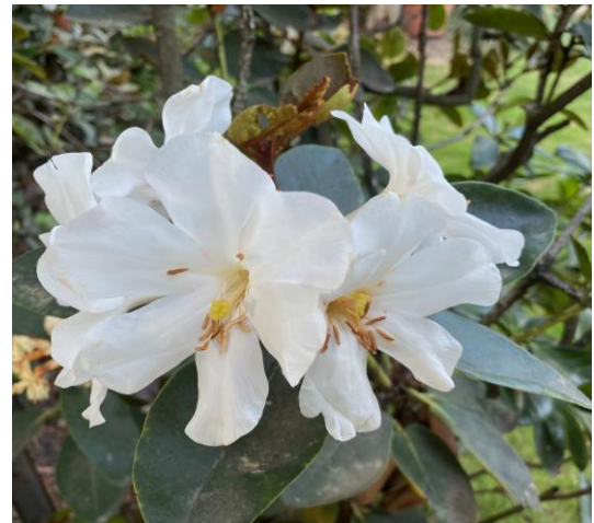
West Papua form of R. konori