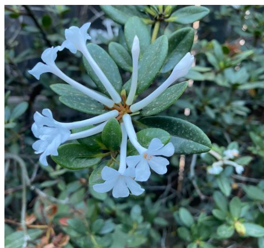
R. jasminiflorum ssp. heusseri