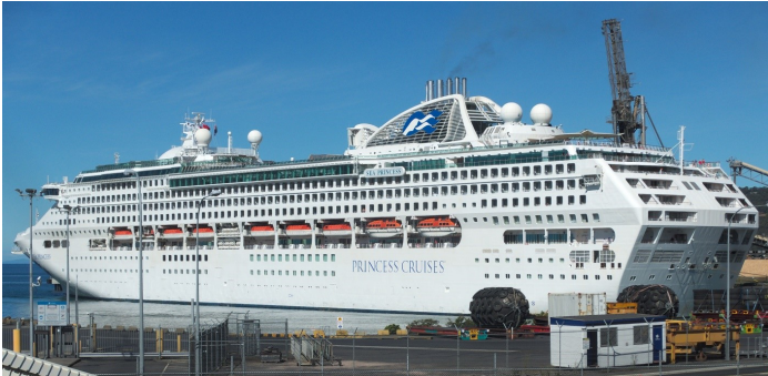
A cruise ship docked at the Port of Burnie.