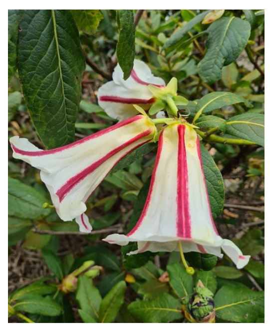
Rhododendron dalhousiae var. rhabdotum