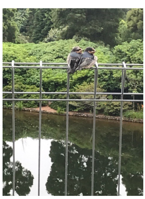
Geoff noticed a mother and haby swallow on our halcony. The hub was learning to fly and took off a little later.