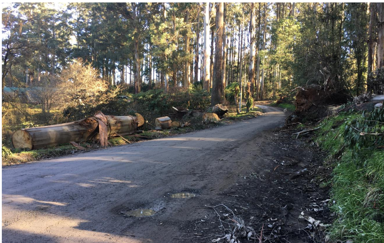
Trees down along The Georgian Rd, Vireya Café in the background

Overall, the DRBG survived the storm with less damage than was suffered in some other parts of the Dandenong Ranges. Some significant trees in the Garden were brought down, including a large oak next to the main rock garden (taking with it much of the road), a large, rare pine on The Georgian Road boundary, several eucalypts and conifers in the centre of the Garden and many trees in the Messmate Forest, the Maddeni Walk and the Lyrebird Gully. In the main, the damage was mostly confined to the edge of the Garden with many 60 metre ash trees down along The Georgian Road including several massive trees down in the overflow carpark opposite the DRBG front gate. Remarkably, no buildings at the Garden were damaged. Amazingly, one 40 metre ash, between the footy ground and the Parks Vic staff carpark, fell with just its upper most twigs taking some paint off the office spouting (a bit unfortunate given that a damaged office might have initiated the much discussed depot relocation and carpark redevelopment). Access to the Garden is now open but parts of the Garden such as the forest areas (Maddeni, Messmate and Lyrebird Gully) will remain closed for many months. Overall, the garden collection came through pretty much unscathed.