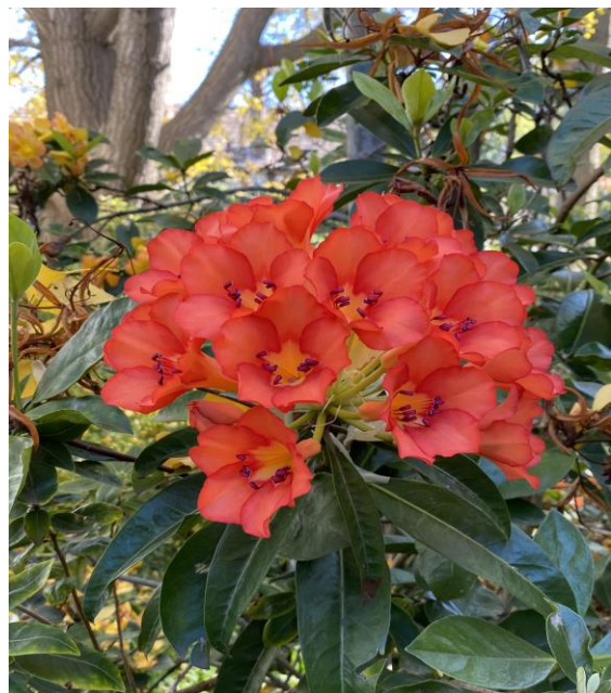
R. javanicum ssp. kinabaluense