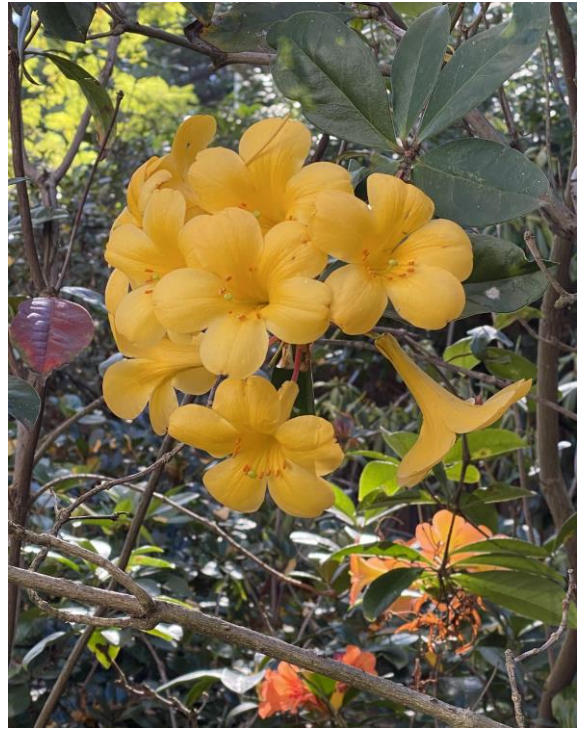
R. aurigeranum x R. laetum