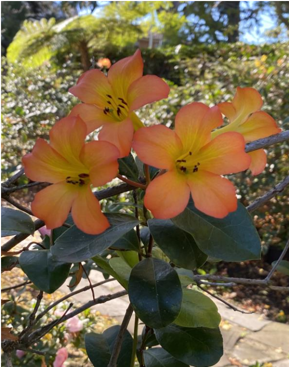
R. Clare Rouse (R. christiana x R. laetum)