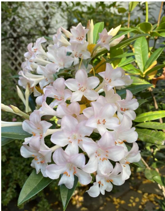
R. Princess Alexandra