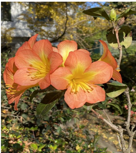
R. zoelleri (Michael Black form)