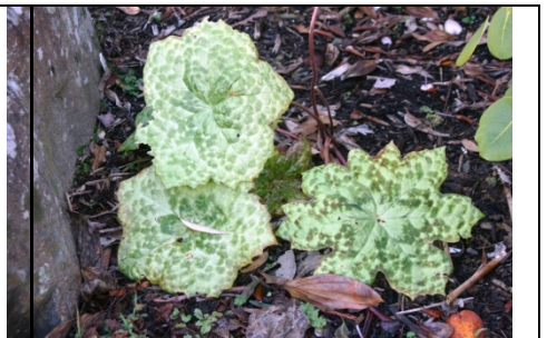
Podophyllum 'Spotty Dotty'

Our plant of Weldenia candida , which is herbaceous, is very pretty, with its glistening white petals. Protea cynaroides in the front garden has its lovely large flower half open. It is a majestic pink bloom when fully open and can stand a dry sunny position. Nearby is a plant of Protea 'Pink Ice' , a hybrid of P. neriifolia with pretty bright pink flowers and the usual fringed tips to the petals.