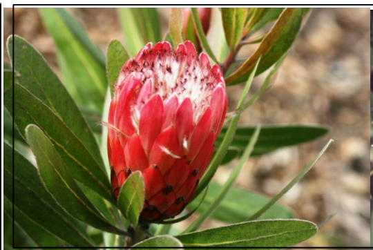
Protea 'Pink Ice'