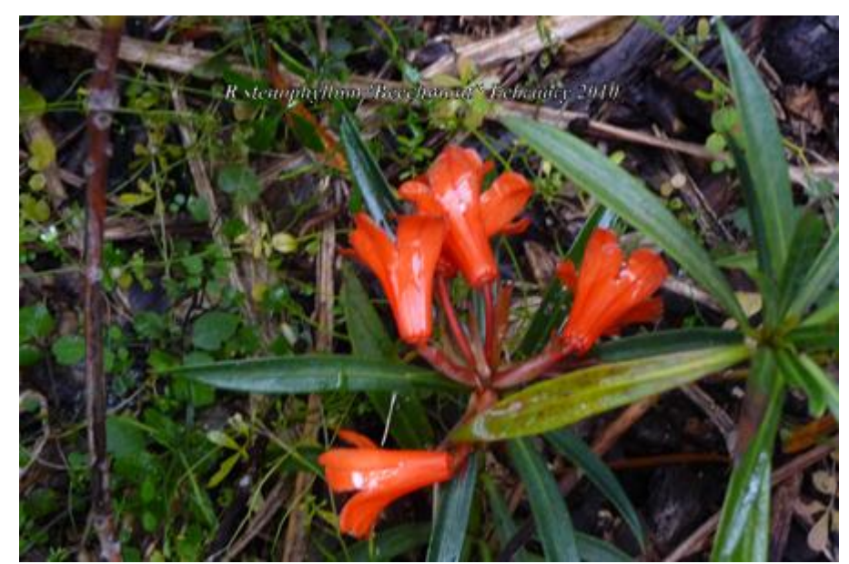
R stenophyllum "Beechmont", February 2010