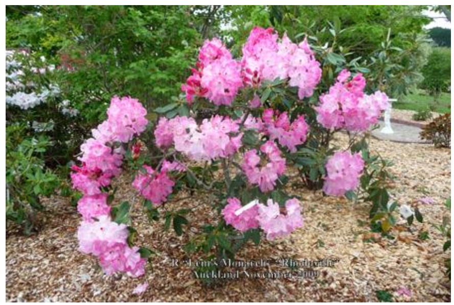
R "Lem's Monarch", Rhodoville, Auckland, November 2009