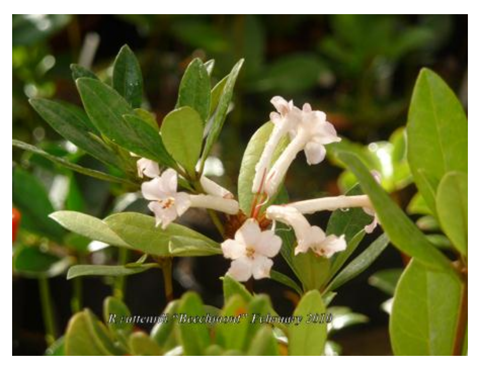
R ruttennii "Beechmont", February 2010