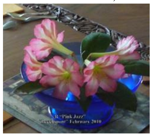
R "Pink Jazz", "Beechmont", February 2010