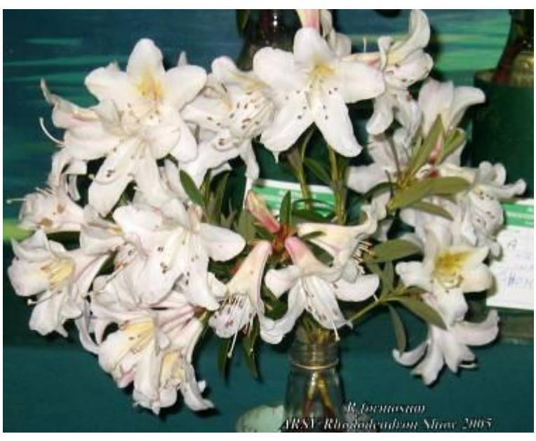
R formosum ARSV Rhododendron Show 2005