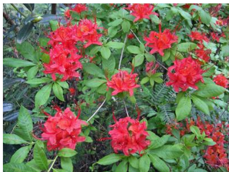
R. cumberlandense December 2009