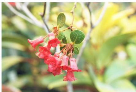
R. inconspicuum