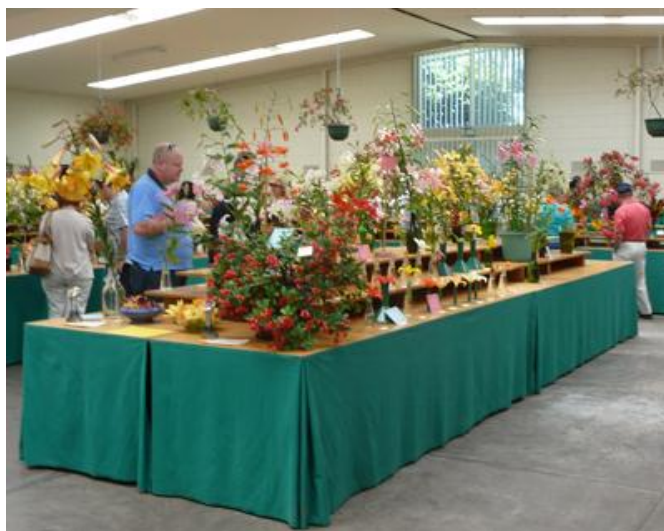
FCBS and ARSV Lilium and Vireya Show January 2009