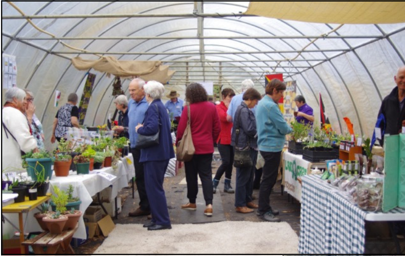
Around 'Woodbank' on Plant Fair day