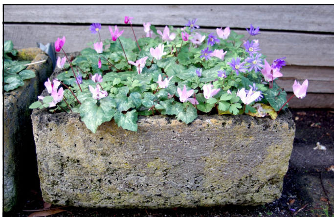
At left is one of Ken's 40 yr.old troughs still going strong.

At our September meeting Ken introduced us to making hypertufa pots and although he had made many hundreds in the past he still went to a great deal of trouble with the preparation in readiness for his demonstration - even experimenting with a couple of different shapes in the week prior. These were later added to our auction. He also researched some of the different mediums now being used but the basic principles still apply. Was great to have this practical demonstration along with all the tips and tricks to achieve the desired product, including how to add colour and texture. Many left anxious to get started on their own projects. Thank you Ken for the work you put into this exercise. Ken's recipe and a lighter mix is an attachment with this newsletter.