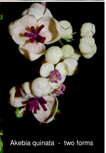
Akebia quinata - two forms