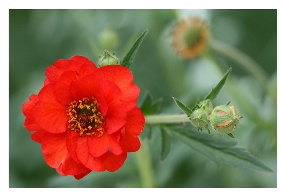
Geum Mrs Bradshaw

Geums are perennials well worth growing. There are taller varieties, "Mrs Bradshaw" (red), "Lady Stratheden" (yellow) as well as dwarf types, very suited to rockeries.