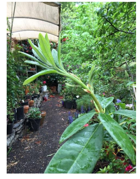
Normal internodal growth