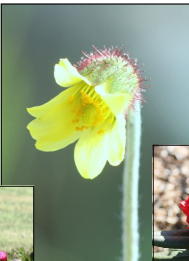
Far left: Dryas octopetala