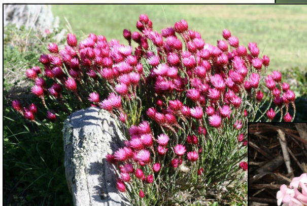
Above: Edmondia humile