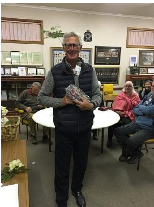
Our two raffle winners.