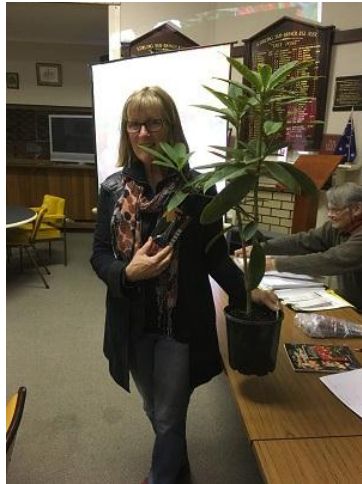
Raffle ticket winners!