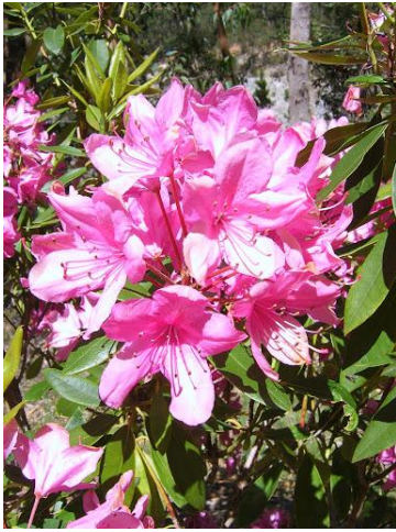
Glenn (named after the Dog)