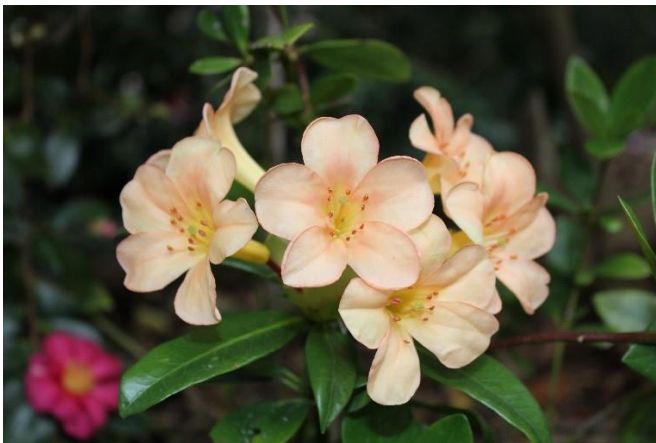
Vireya Just Peachy