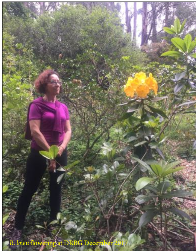
R. lowii flowering at DRBG December 2017