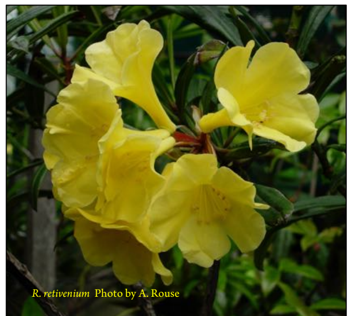
R. retivenium