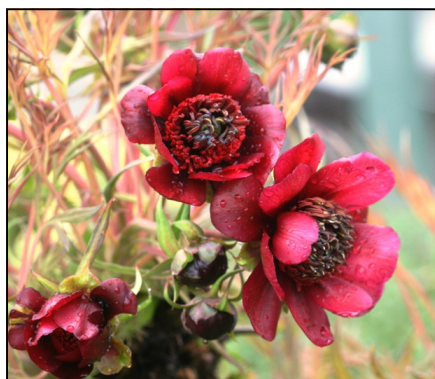
Above: Paeonia delavayii

R. forrestii has spread to a metre across and produced a few brilliant red flowers. We were fortunate to have obtained this good form from Peter Cox Nursery in Scotland before Australia banned imports of Rhododendron and some other genera. Another bright red flowered plant is R. 'Etta Burrows' growing in the bed below the shed. I used to dislike dead heading this plant as it was an unpleasant sticky task and it was always a problem cleaning your hands afterwards. Mollis Azaleas are particularly brilliant when in flower. We have a very pretty pink in full bloom and beside it is a bright orange one just starting to flower. They have been raised from seed, so there is quite a variation in colours. There is another bright orange one growing near the Paulownia . This is now a small tree about four metres high and covered in lavender blue racemes of flowers.