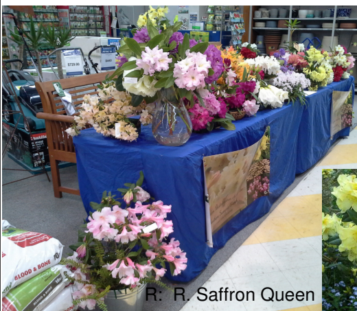
R: R. Saffron Queen