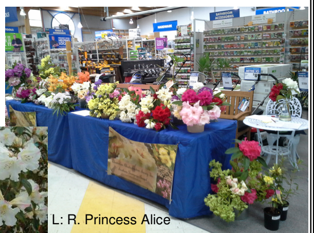
L: R. Princess Alice

Saffron Queen was popular and fortunately also available for purchase. Lot of interest in perfumed varieties