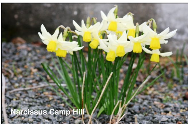
Narcissus Camp Hill

Fritillaria imperialis , the 'Crown Imperial' always flowers when strong winds arrive. Fortunately Ken staked both the orange flowered form, also the yellow one just in time before the wind snapped the stems. Chionodoxa forbesii , we saw growing in Turkey. Ken had raised a batch of seedlings a few years ago. They have grown so well, he has divided and planted two more patches. The flowers are very similar to C. sardensis with deep bright blue flowers. Tecophila cyanocrocus , a very rare bulb from Chile, with intense deep blue flowers, have been in flower in a couple of hypertufa tubs Ken made. We had them in a warm spot against the house. There are also several in the rock garden, the bulb bed and in another bed at the street side of the house. More are in styrene boxes in shade. The ones in the hypertufa tubs have finished flowering, the ones in the garden are in full flower and the ones in styrene boxes in shade are still to open. I have not yet produced a satisfactory painting of it yet but will have to try again.