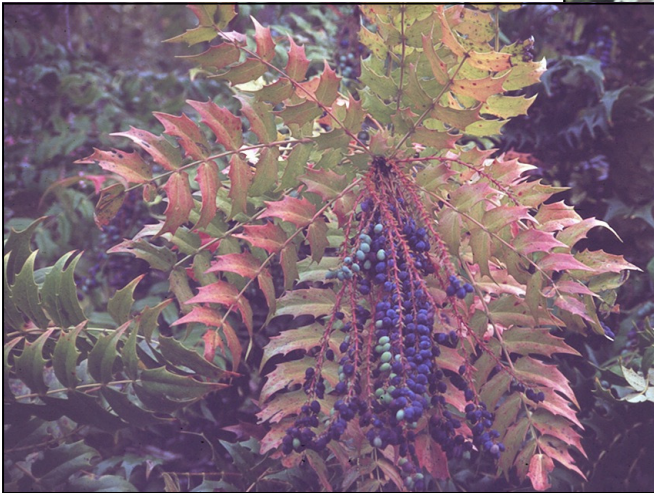
Below: Mahonia Japonica