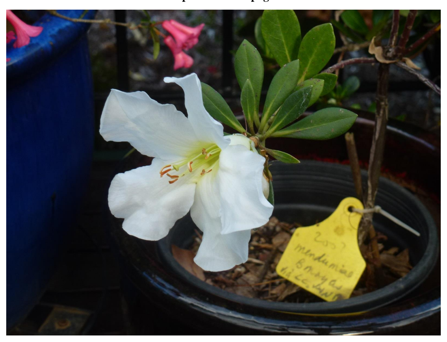
R mendumiae Simon and Marcia Begg's deck. 10 March 2015. Page