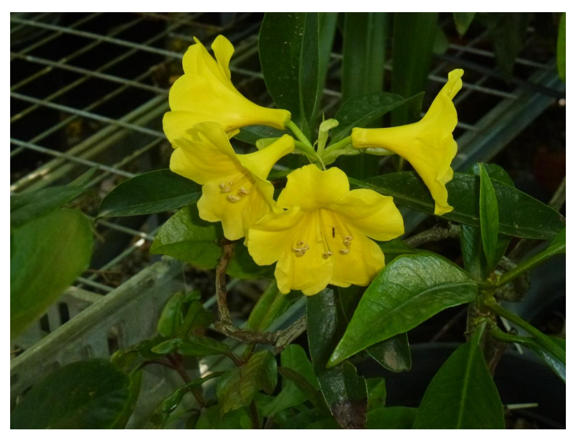
R retivenium 27 December 2014