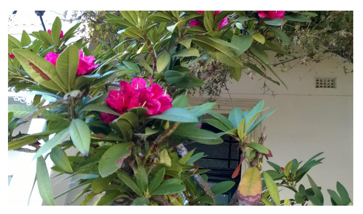
Unseasonal Rhododendron in Carlton- see page 2