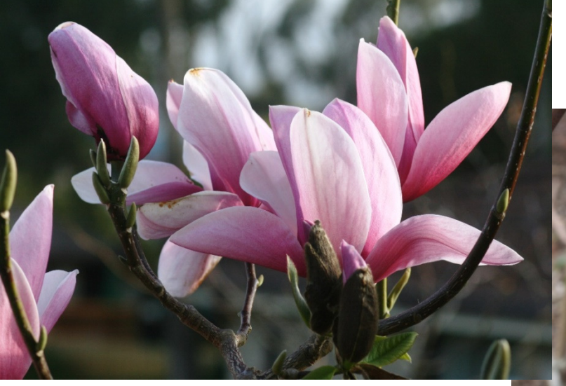
Magnolia Star Wars has several large pink flowers open and behind it is Magnolia Black Tulip with intense blackish purple goblet-shaped blooms.

the most intense deep blue flowers. These last are near a Cyclamen libanoticum making a pretty contrast of blue and pink.