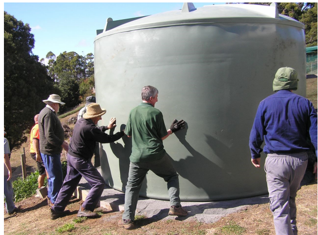
Bringing in the rainwater tank for the nursery. As expected, many hands made for light work.