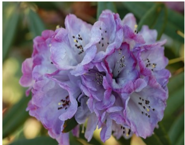
R. anthosphaerum flowering in Sichuan.