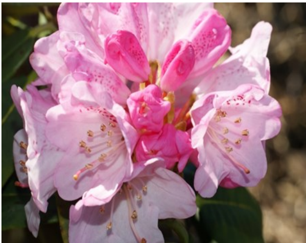
R. principis- flowering in Tibet.

Here are some of our Rhododendrons planted out in the last few years and flowering for the first time: