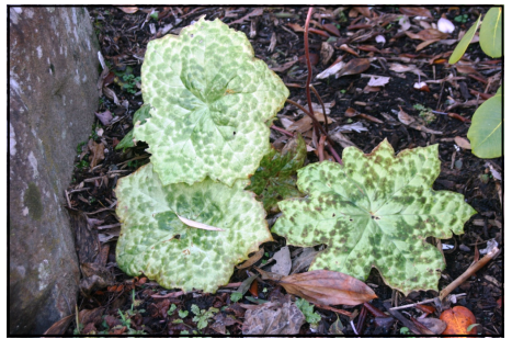
Podophyllum 'Spotty Dotty'