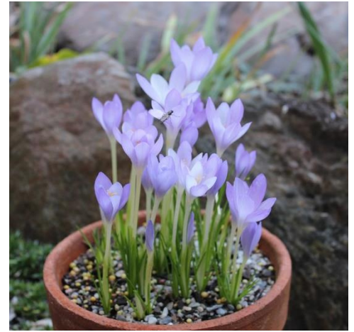
Crocus from seed

Anzac Day is the traditional time to fertilise Paeony roses. They are heavy feeders that prefer a slightly alkaline soil so use dolomite lime and either some well-rotted fowl manure or some blood and bone. Another application in spring will keep them growing strongly