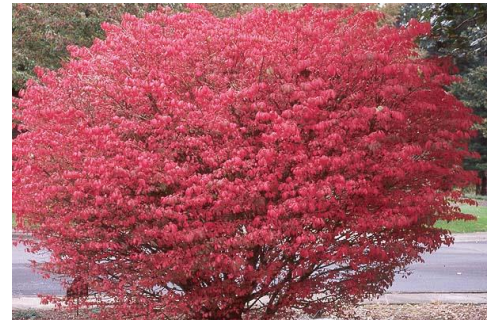
Euonymus Alatus in Autumn