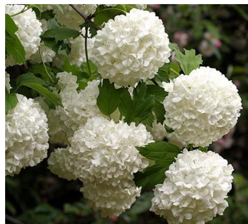
Viburnum opulus Sterile