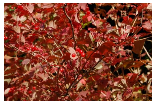
Viburnum Opulus in Autumn