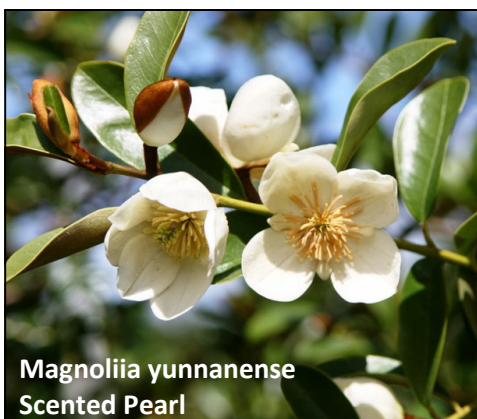
Magnolia yunnanense Scented Pearl

There is a Daphne tangutica flowering in the rock garden and another in the garden near the house. Aubretia are looking bright this year with light purple-blue masses of flowers. The ones in the retaining wall below the garage are also in flower.