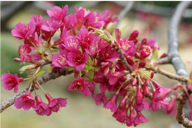
Prunus campanulata – 'Formosan cherry '

About three dozen of our members were gathered to hear some details about some Japanese rhododendron species. The tiny blooms of a semi-deciduous azalea were a surprise to many of us. Another interesting presentation from our Maurie, who's incredible knowledge continues to amaze us mere mortals.