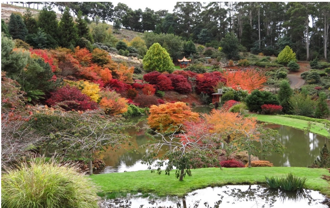
Autumn colour at the EVRG