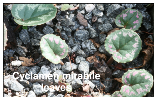
Cyclamen mirabile leaves