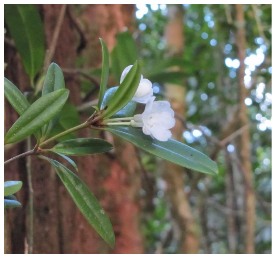
Figure 1 R. chamahensis