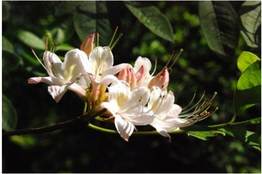
Figure 2 R. colemanii

(from http://www.auburn.edu/academic/science_math/cosam/collections/arboretum/plants-and-horticulture/image_gallery/Azalea_gallery/full_size/Red%20Hills%20Azalea%20Rhododendron%20colema nii.JPG)