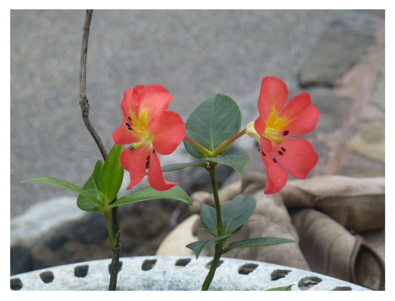
R wentianum April 2014