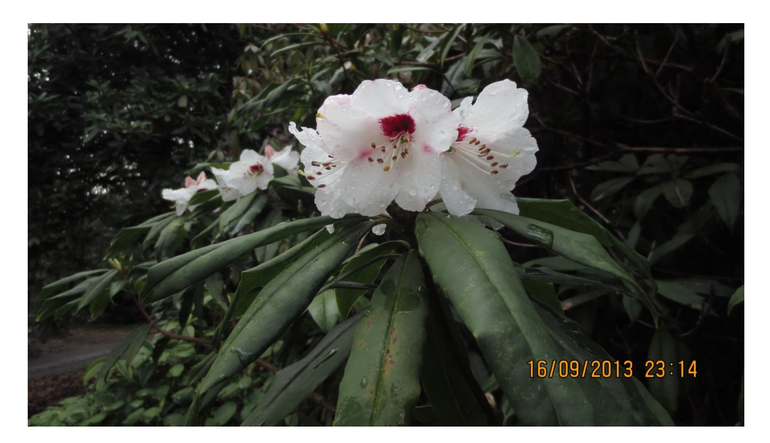
R araiophyllum September 2014