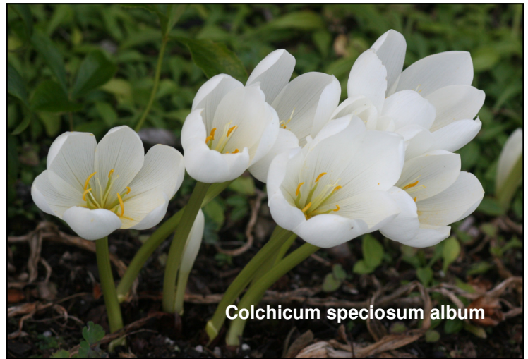
Colchicum speciosum album

Now we are into autumn you expect to see a few bulbs thrust their blooms through. Colchicum autumnale and C. agrippinum were the first to appear. Then they are quickly followed by C.a.alba and C.speciosum . The