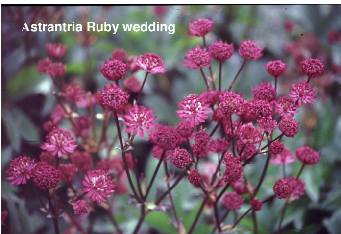
Astrantia Ruby wedding