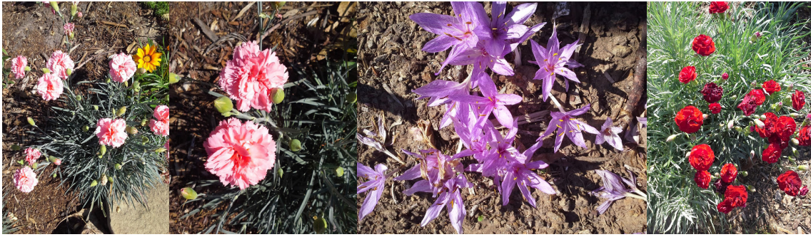
A splash of colour in Ken and Lesley's garden in March