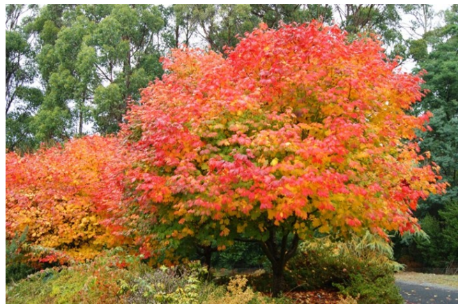
Above: Our Acer japonicum aconitifolium s in all their glory. Below: More autumn colours.

Enjoy the remaining colours of autumn and if you haven't been in to visit, make sure you do. Until next month stay warm. Maurie and Juanita