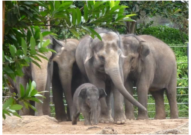
'Mali' baby elephant at Melbourne Zoo.