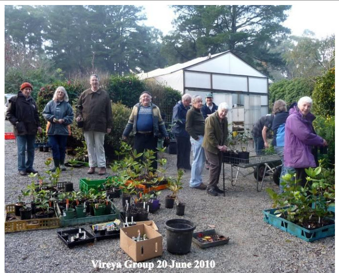
Vireya Group at "Beechmont" 20 June 2010