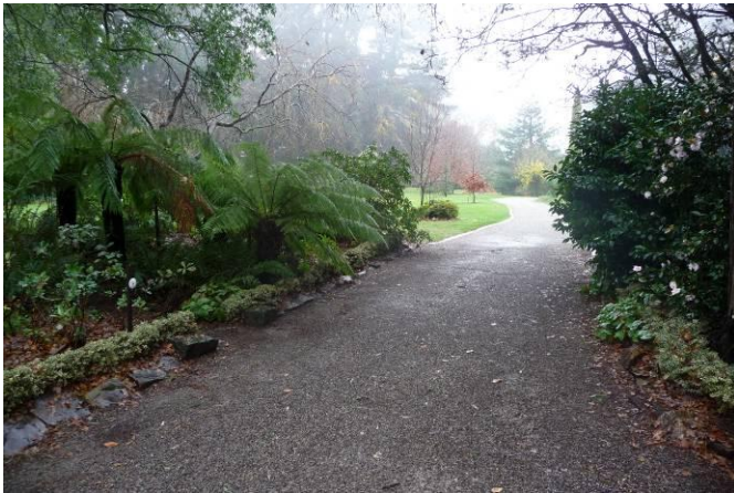
"Beechmont" June 2010