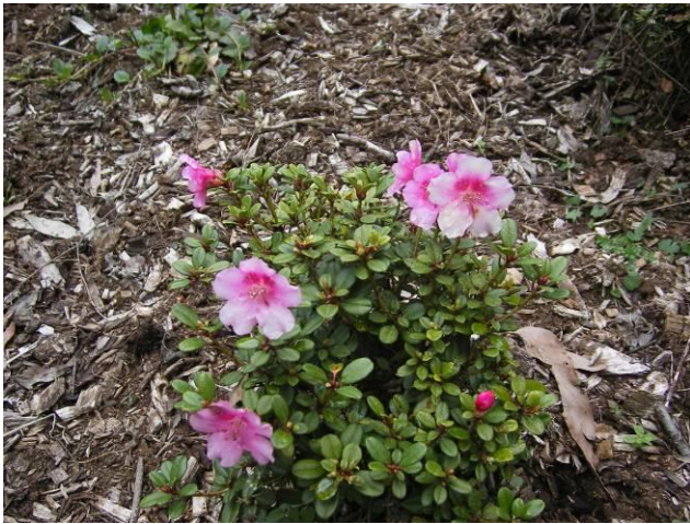
R dendrocharis