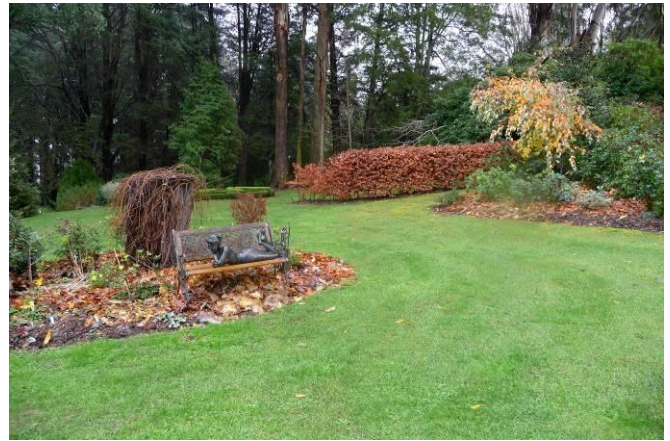
"Beechmont" June 2010