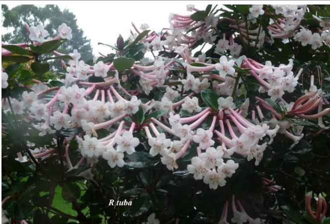
R tuba , "Beechmont", May 2010