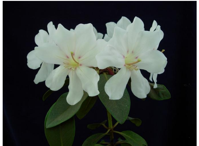
R konori 'White Giant'