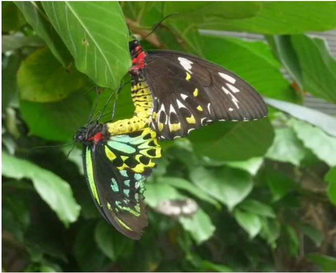
The Butterfly House at Melbourne